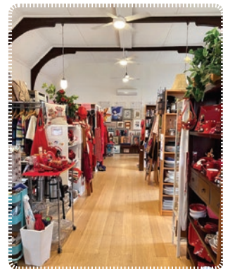
Red Hill Op Shop 40 Year Anniversary