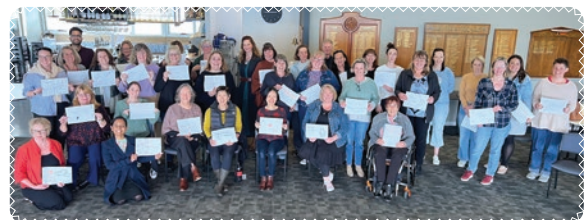
All-Staff Training Day

I wish everyone a safe and joyful Festive Season and a happy, healthy New Year.