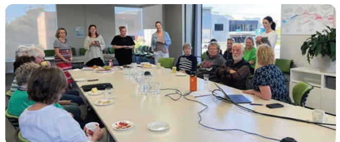
Client Care Volunteers Celebrating Volunteer Week 2023