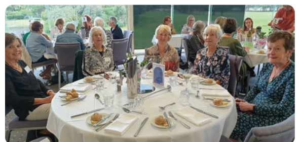
Mornington Auxiliary Fundraising Luncheon